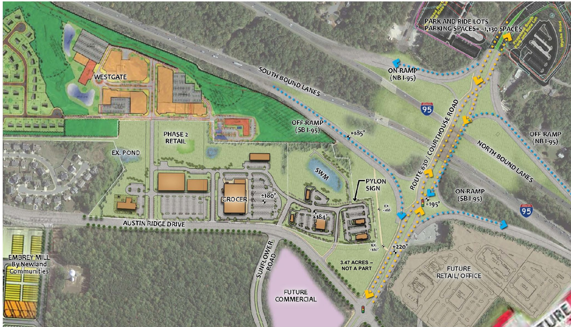
Site Plan Illustrative