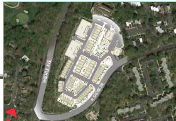
Tall Oaks Village Center 12040 North Shore Drive

Wiehle Avenue and North Shore Drive | Reston, VA 20190